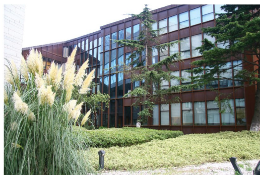
Sino-French Center Building, Tongji Campus