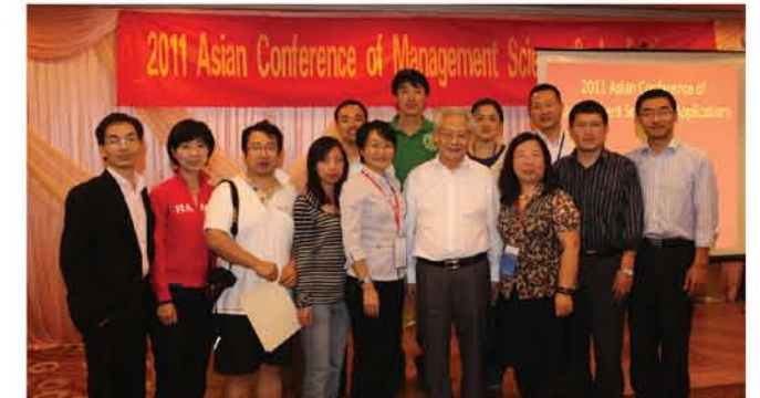
Scholars of SEM participate in the conference