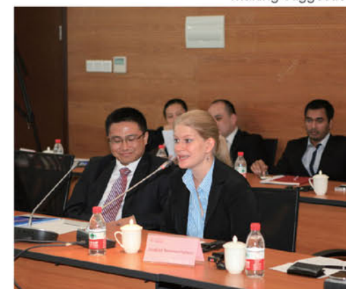
Student representative making suggestions