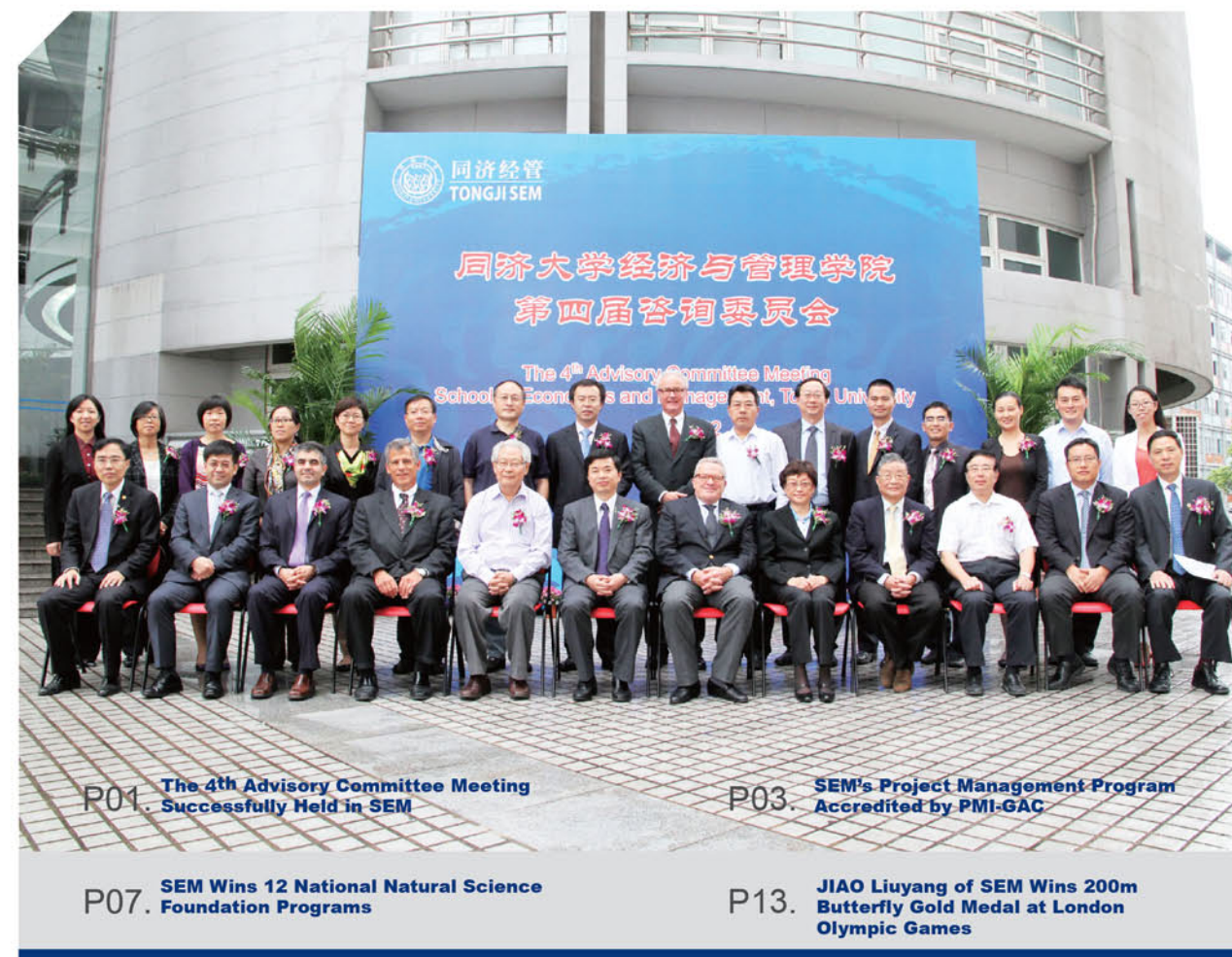
P01. The 4th Advisory Committee Meeting Successfully Held in SEM

Address: Siping Road 1239, Shanghai 200092, China Tel: 0086-21-65983943 Fax: 0086-21-65986304 http://sem.tongji.edu.cn