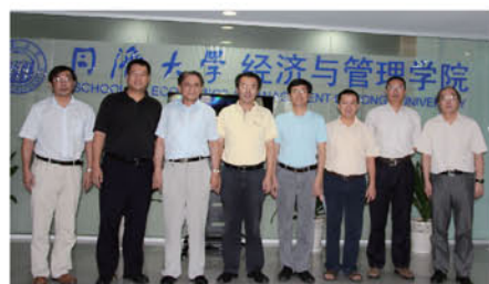
Posed for a group photo