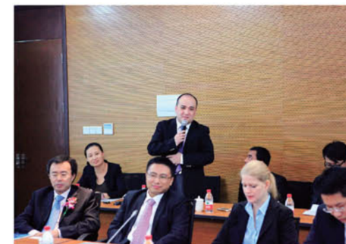
Student representative making suggestions