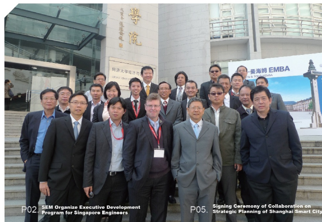
P02. SEM Organize Executive Development Program for Singapore Engineers

Address: Siping Road 1239, Shanghai 200092, China Tel: 0086-21-65983943 Fax: 0086-21-65986304 http://sem.tongji.edu.cn